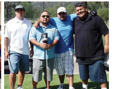
The Tournament Winners Group