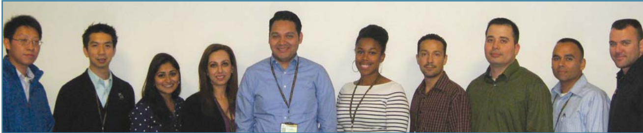
CAPE's newest members from DPW during their orientation in May.