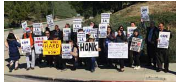
CAPE Members in the North District Assessor's Office walking the informational picket line on Feb. 6.

More than 250 CAPE Members joined together for a day of solidarity and support for their colleagues speaking about contract negotiations at the Board of Supervisors meeting on Oct. 30.