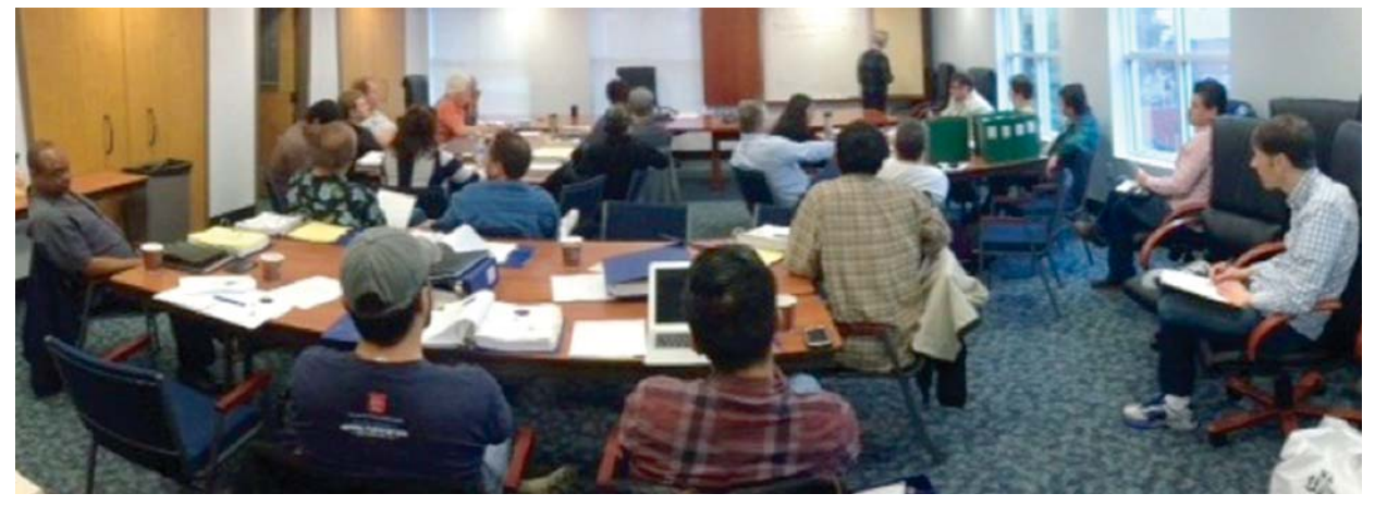
CAPE Team members work to develop their initial proposals for the upcoming contract negotiations during a proposal development session at CAPE on Saturday, February 21st.

For up-to-the-minute reports on the progress of CAPE's bargaining team, make sure your email address is on the list for regular updates. To be added to the CAPE email distribution send your preferred email address to info@capeunion.org.