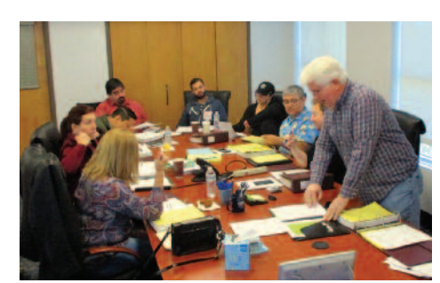
Bargaining Units 131-132

CAPE has started the process in preparation for the 2018 contract negotiations with Los Angeles County on successor contracts for units 131, 132, 501, 502, 511 and 512.