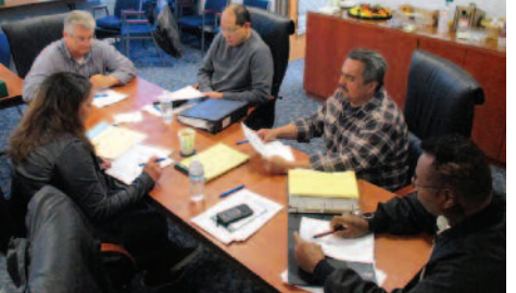
Bargaining Units 511-512

Proposals are currently in the process for that contract. The Fringe Benefits contract covers all represented Los Angeles County employees and includes MOUs on